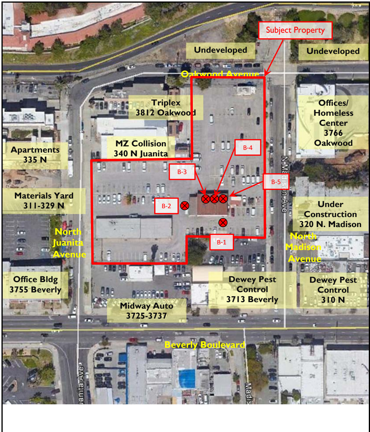
FIGURE 3 – BORING LOCATION MAP